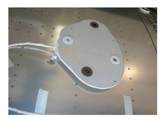
ARISS L/S-band patch antenna