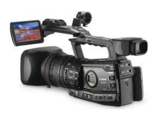
Canon XF-305 camera