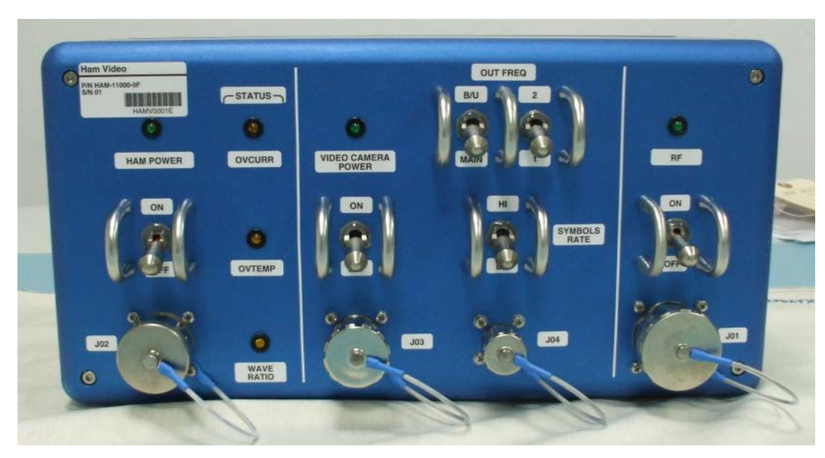
Ham Video DATV transmitter